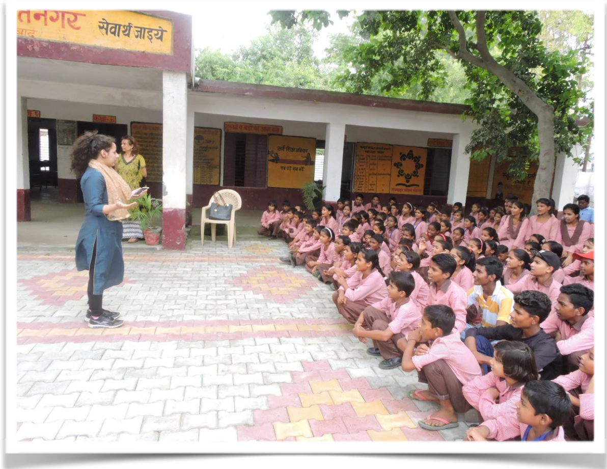
School Students Interaction