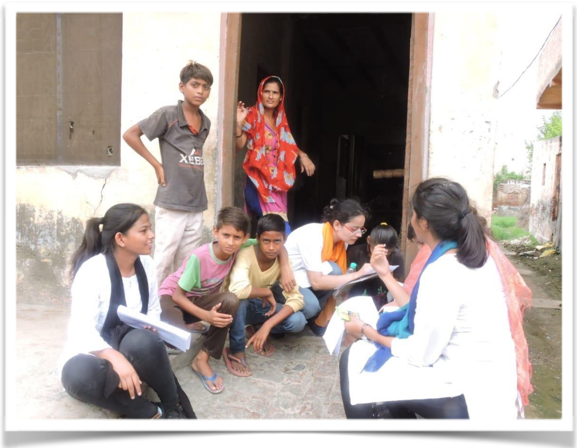
Interactions with the Villagers