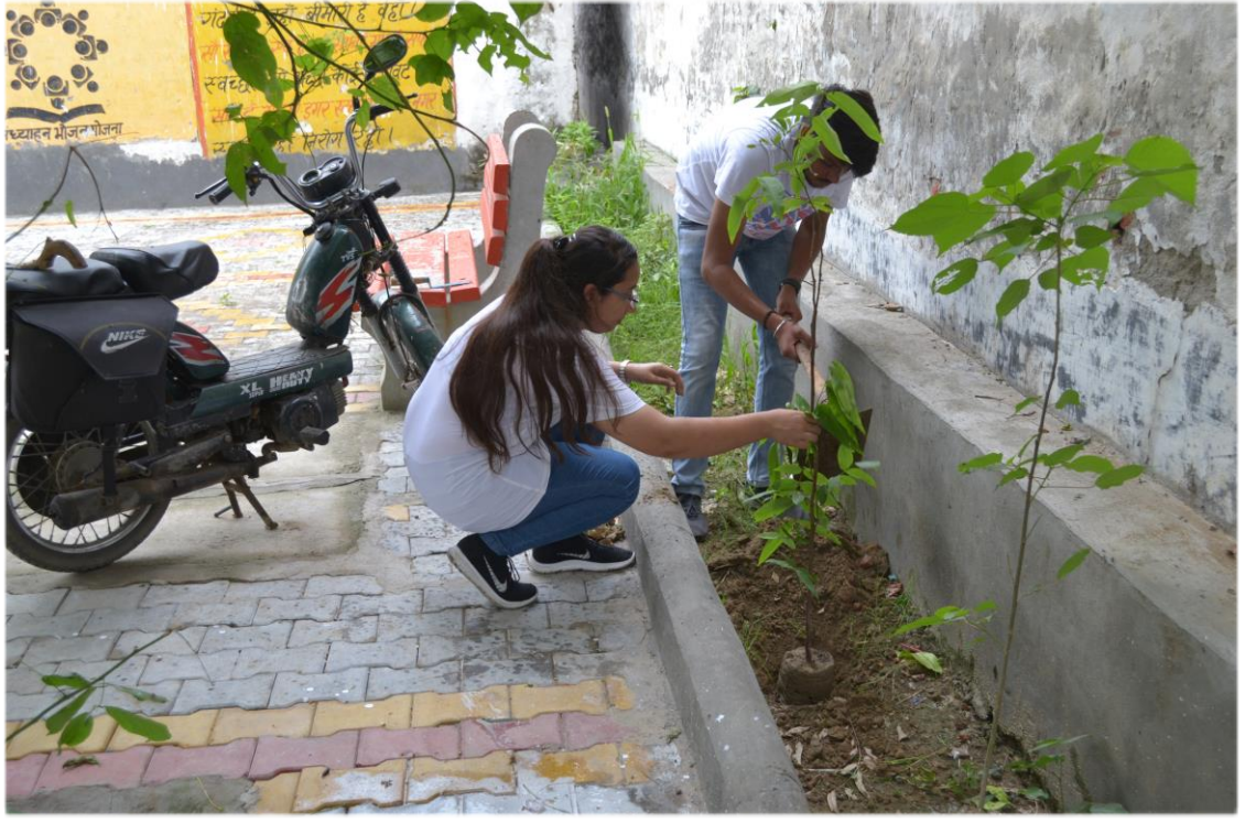
Tree Plantation Drive