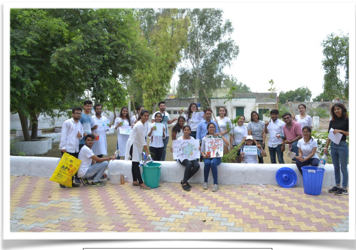
Activity Time for the students